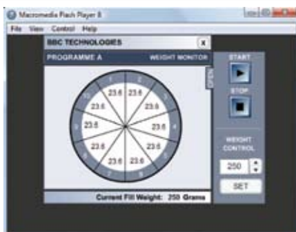
The user interface has been designed with simplicity in mind

NEW ZEALAND OFFICE 397 Jary Road, RD1 Ohaupo, NZ ph +64 (0) 7 823 6927 fax +64 (0) 7 823 6925