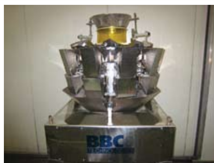
The 10 Head Combination Weigher is capable of up to 100 Weighments per minute