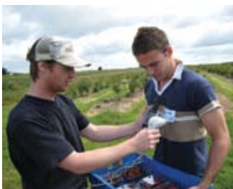
Barcode scanners check pickers ID Code.

Provides ability to select which characteristics are traceable and accountable. If contamination is found, Freshtracker isolates the problem to specific time, field, row, picker and bin, saving you from Total Farm Contamination.