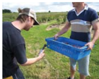
GPS scanner locates RFID on Field Container.